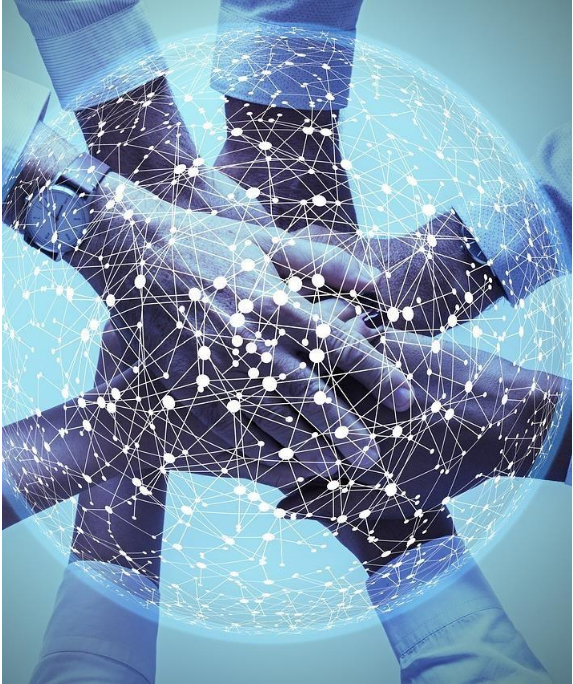
MS Board of Nursing (838-00)